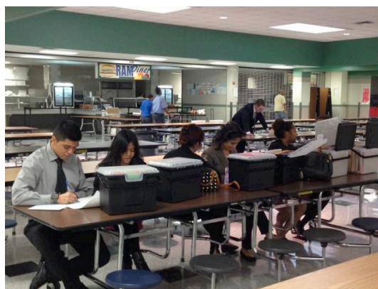
NDHS Debate Team gets ready for district competition

NDBSL is asking all members and interested Bulldog supporters to help send ten students to one week of debate camp this summer. Cost is approximately $500 per student for a total of $5000. Several members have already stepped up to donate. If you would like to support these dedicated students, send a check to NDBSL, P.O. Box 600996, Dallas, TX 75360 and write "Debate" in the memo line. Ten talented students will be given a wonderful opportunity to hone an important skill, make North Dallas proud and have fun at the same time.